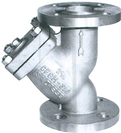
2 1/2" YS 61-SS